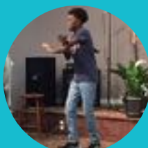
I loved seeing young leaders engaged in ministry on my visit to New Hope (Rochester)

Visiting Heart & Soul (Rochester) included watching the praise dance of a young man who was praising the Lord with his whole heart (and body!). It also included celebrating with the church as they announced the purchase of the vacant lot next door which will provide for more parking.